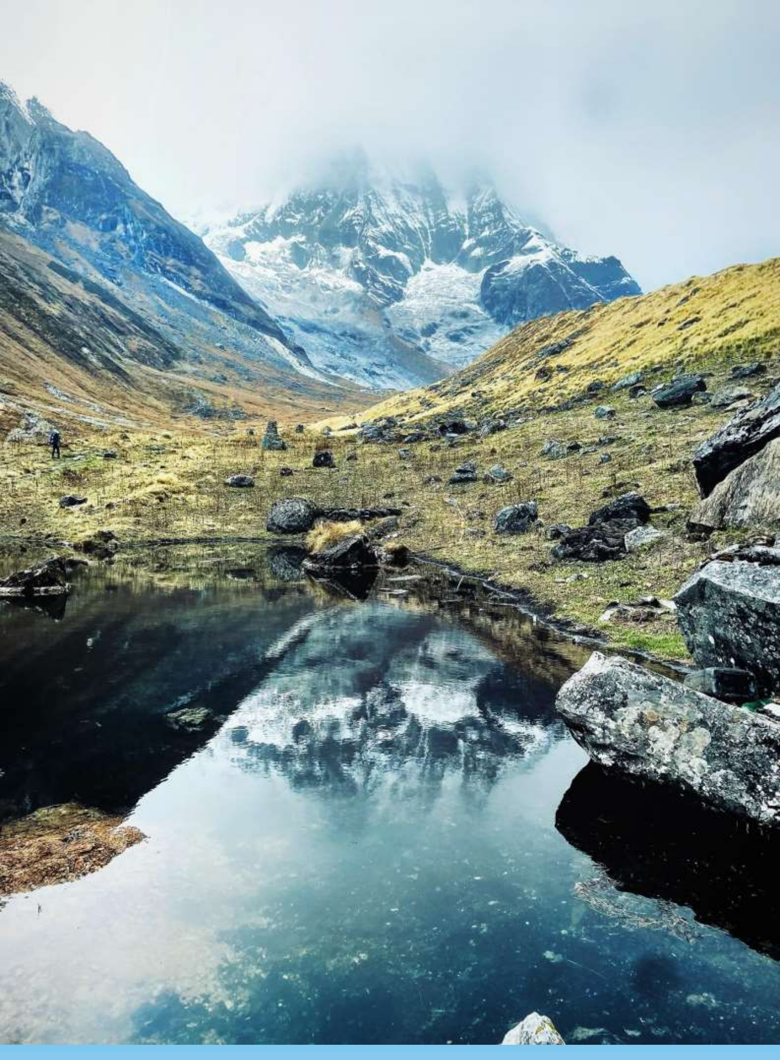
Peak Annapurna South